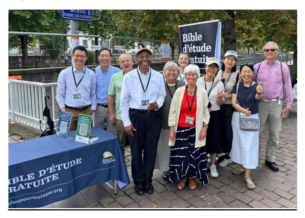
Lord gain these new ones for the church life in Strasbourg!