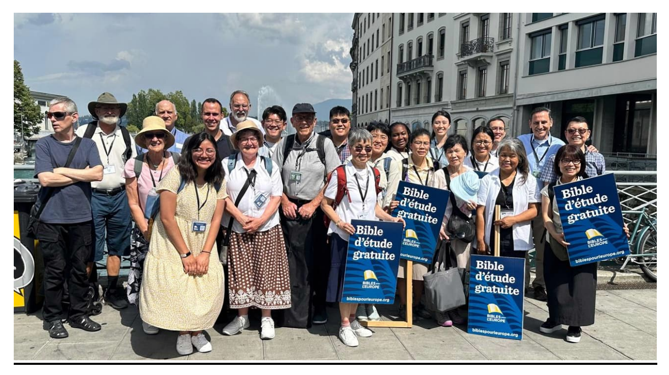
Lord, use the ones we have met to raise up the church in Geneva.